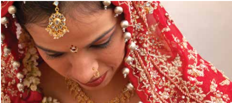
Top to bottom: Four Seasons Hotel Mumbai, traditional Indian attire.