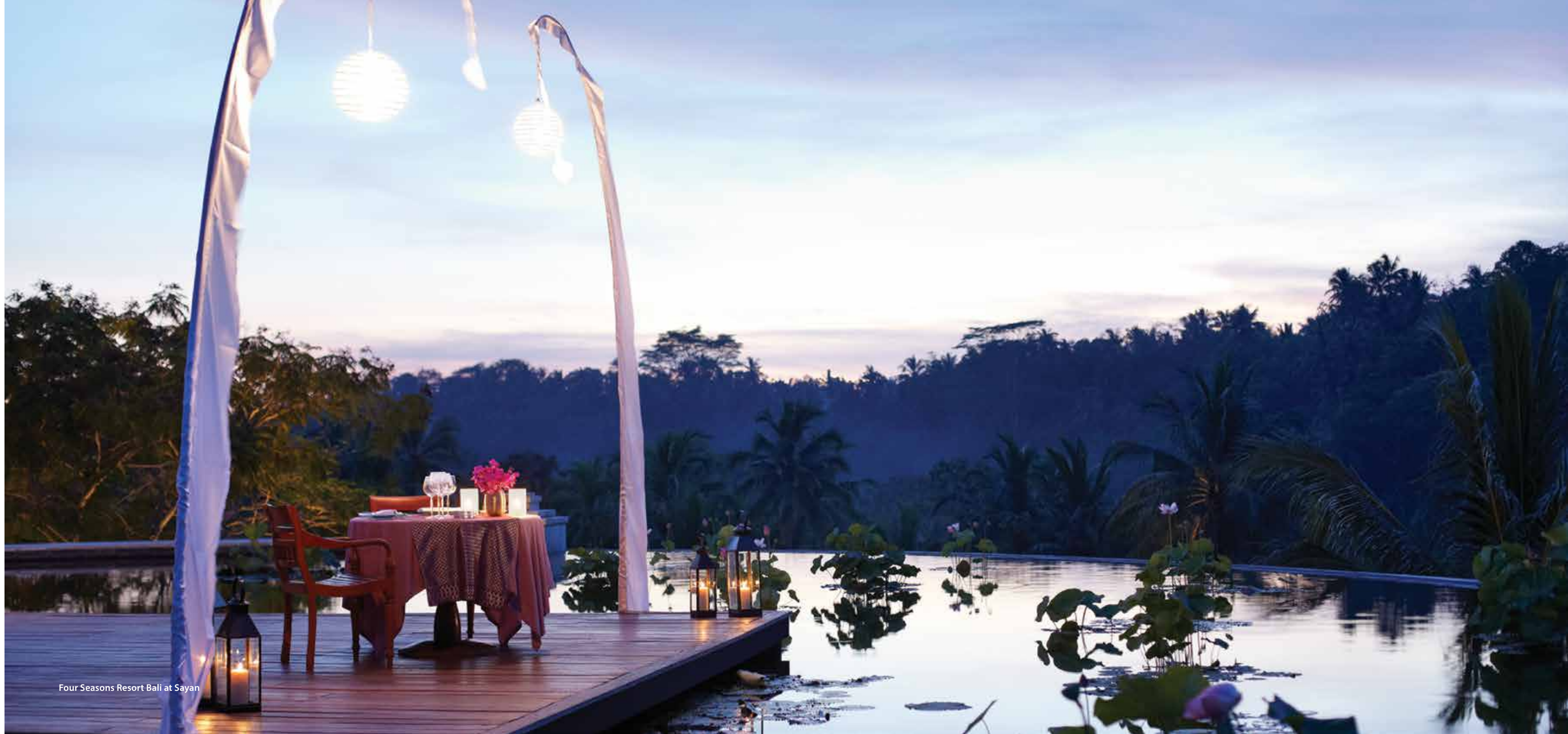
Four Seasons Resort Bali at Sayan

Please join us for what will undoubtedly be a most remarkable travel experience, Four Seasons style.