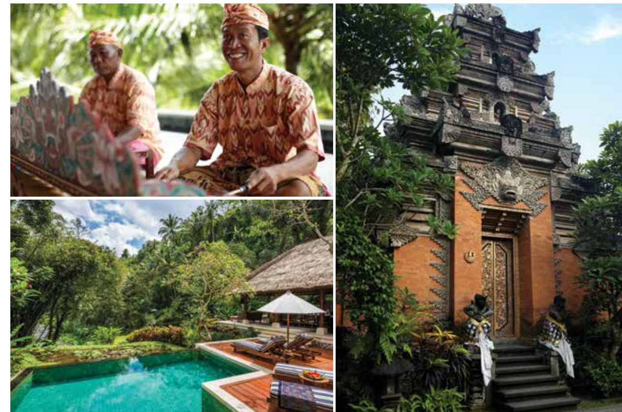
Clockwise from top left: Local musicians, local temple in Ubud, Four Seasons Resort Bali at Sayan.

Immerse yourself in Bali's beautiful landscapes and refreshingly spiritual perspective. This Indonesian island remains a traveler's paradise.