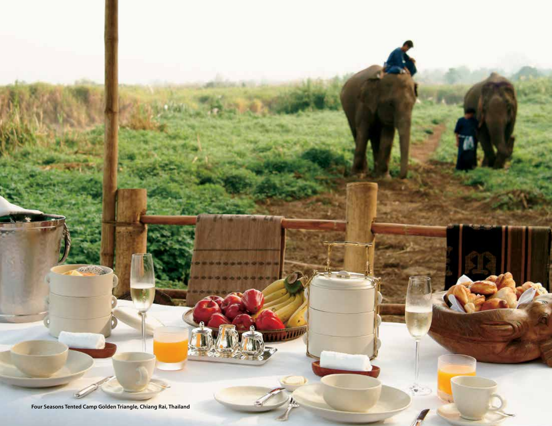
Four Seasons Tented Camp Golden Triangle, Chiang Rai, Thailand