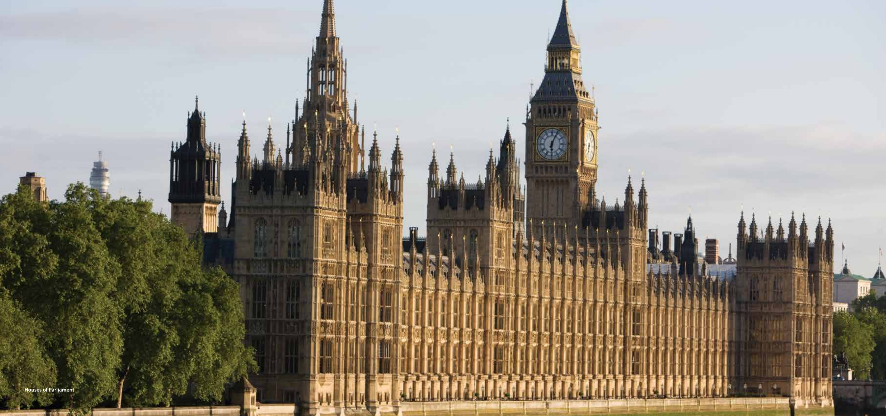
Houses of Parliament