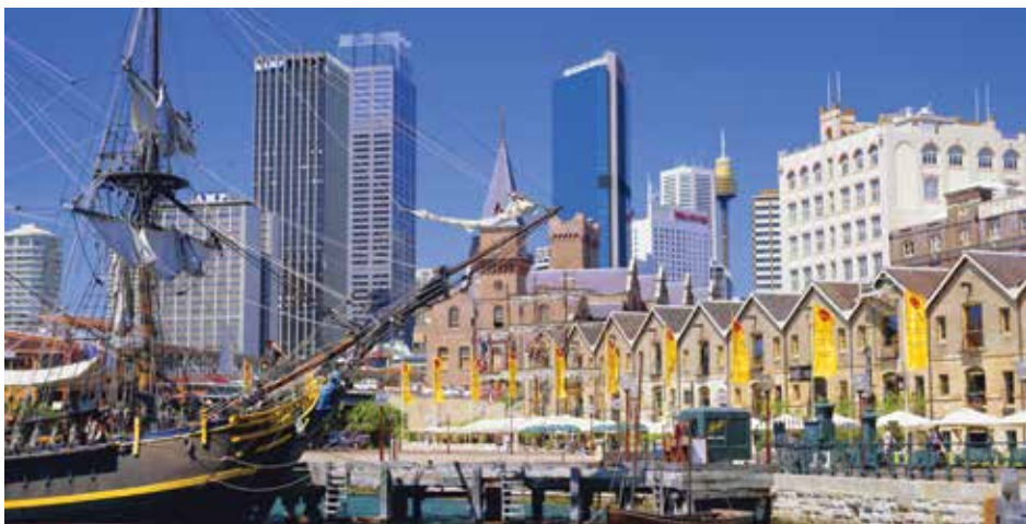
Top to bottom: Koala, historic Rocks district.