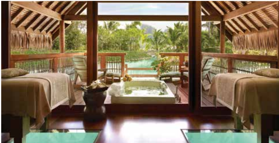
Top to bottom: Traditional fire dancers, Kahaia spa suite, Four Seasons Resort Bora Bora.