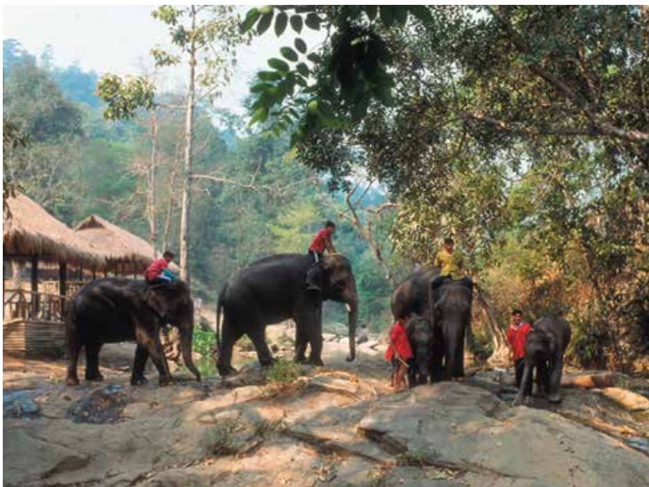
Above: Elephant trekking. Right: Four Seasons Resort Chiang Mai.