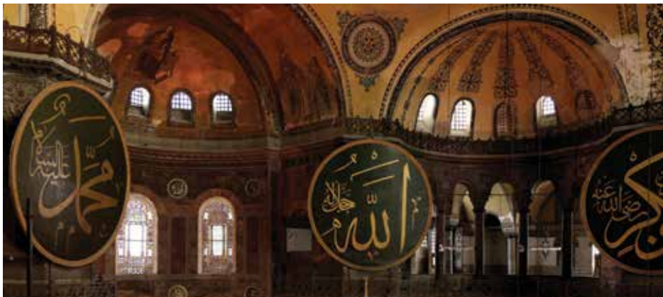
Top to bottom: Four Seasons Hotel Istanbul at the Bosphorus, Hagia Sophia interior.