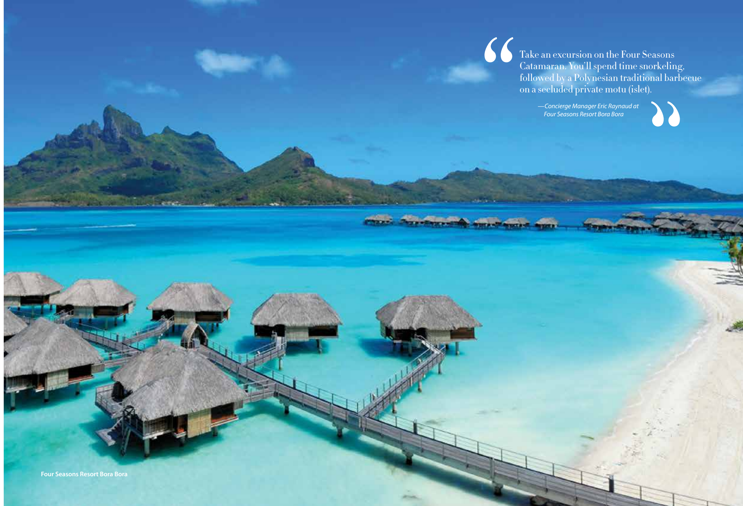
Four Seasons Resort Bora Bora

Set on a private motu (a small islet), Four Seasons Resort Bora Bora welcomes you to a village-like setting inspired by Polynesian architecture. Relax in your own overwater bungalow, perched on stilts above the turquoise lagoon. Spirit yourself away to the spa and be lulled by sounds of the surf.