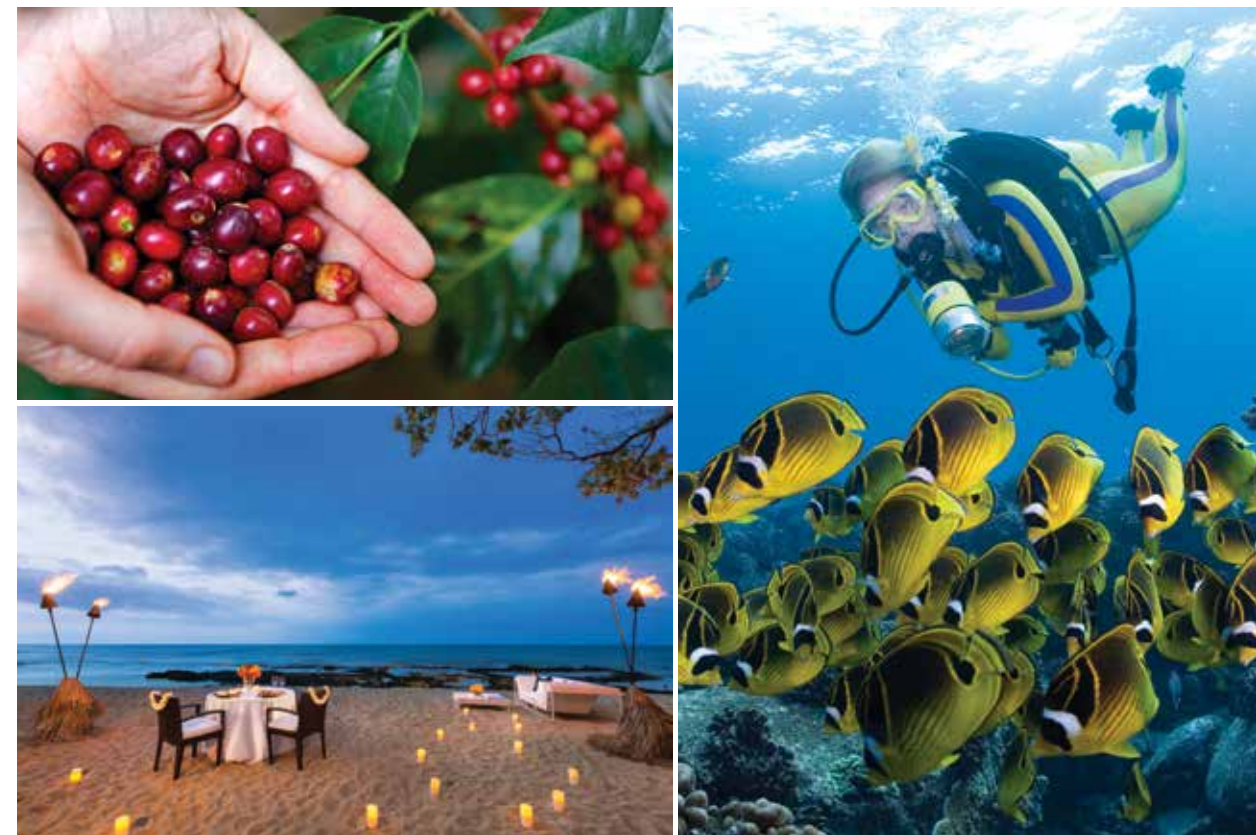
Clockwise from top left: Coffee plantation, scuba diving in Kona, Hawaii, private beach dinner.

Located on Hawaii's Big Island, Kona is renowned for its calm, clear waters, the rugged beauty of its volcanoes and lava fields, and the intensely rich coffee that grows in this region.