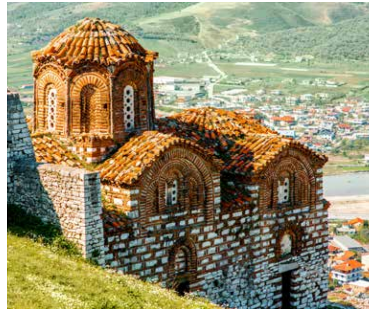
Far left: 16th century icon by Onufri // Left: Monument to Albania's national hero in Skanderbeg Square, Tirana Top: NEED CAPTION // Bottom: St. Theodore's church, Berat