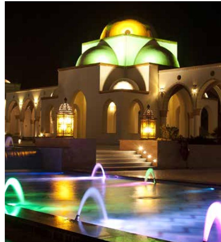
Far left and top: Spices and handicrafts at the Osh Bazaar // Left: Burana Tower // Bottom: Dancing fountain at night, Bishkek