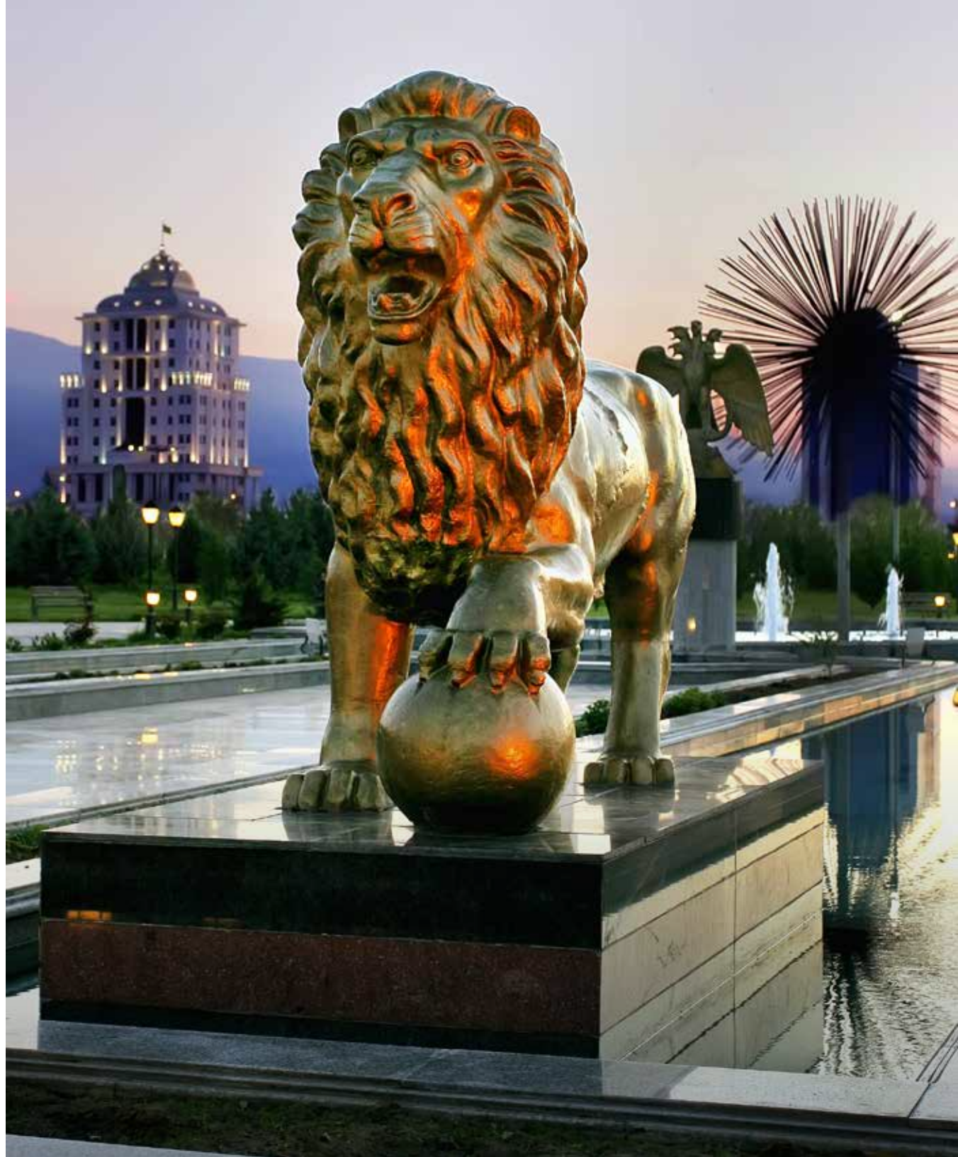
Far right: Door detail of a mosque in Ashgabat Right: The Park of Independence // Top: Sultan Sandjar mosque, Merv // Bottom: President's Palace, Ashgabat