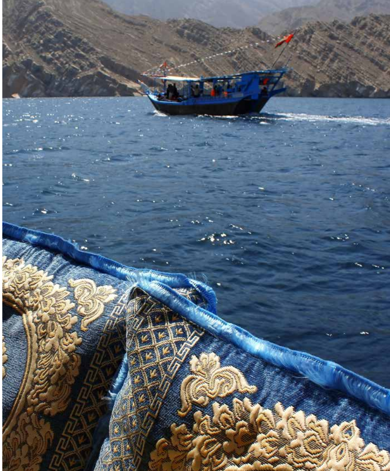
Far right: Colorful fish and coral, Ziggy Bay // Right: Cruise the bay in a traditional dhow // Top: Yoga on the beach (hotel spa photo) Bottom: View from Six Senses Ziggy Bay