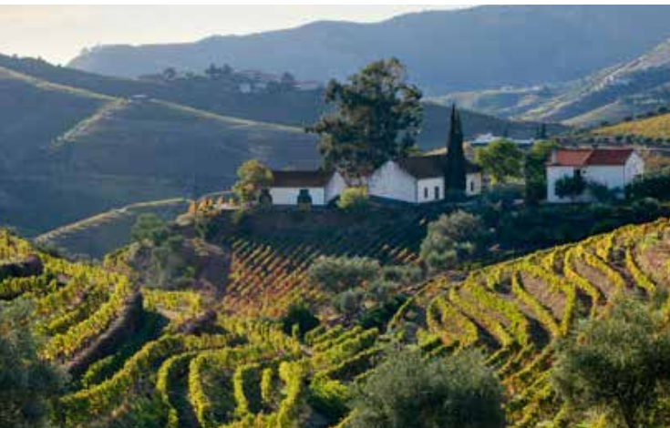
Top: Ashgabat market, Turkmenistan // Bottom: Douro Valley, Portugal // Right: Guggenheim Museum, Bilbao, Spain

At each destination local guides and lecturers join the group, providing deeper insights into the endemic wildlife, incredible flora and diverse peoples. To bring you closer to the culture and meaning of each place, we hire local performers, eat local cuisine and purchase local goods. We also support nonprofit organizations in many of the locations we visit in order to give back to these communities.