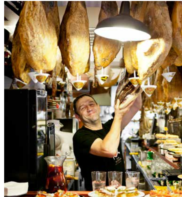
Far left: Idiazabal cheese, a Basque specialty // Left: Hotel du Palais and Grand Plage beach, Biarritz // Top: Guggenheim Museum, Bilbao Bottom: Authentic tapas, San Sebastian