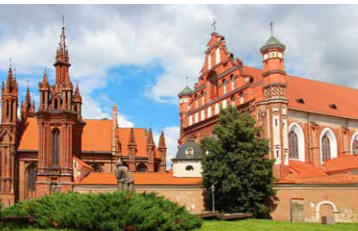
Far right: The dramatic façade of St. Anne's Church, Vilnius Right: Trakai Island Castle, Lake Galve // Top: Bohemian art gallery in the district of Užupis // Bottom: Baroque Church of St. Peter and St. Paul