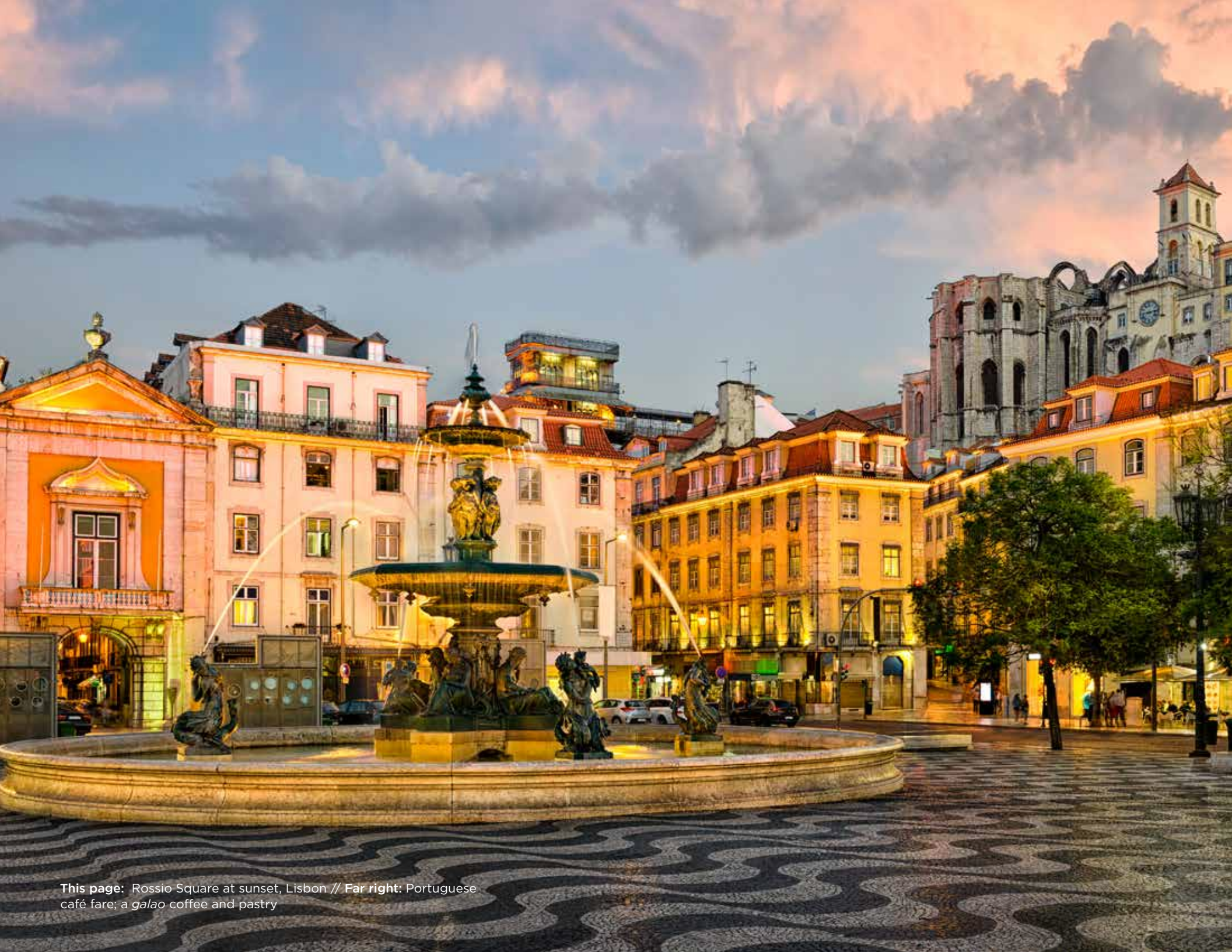
This page: Rossio Square at sunset, Lisbon // Far right: Portuguese café fare; a galao coffee and pastry