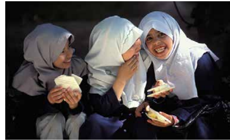
Far left: Minakari handicraft // Left: Sheikh Lotf Allah Mosque, Isfahan // Top: Fin Garden in Kashan, Iran // Bottom: School children in Kashan